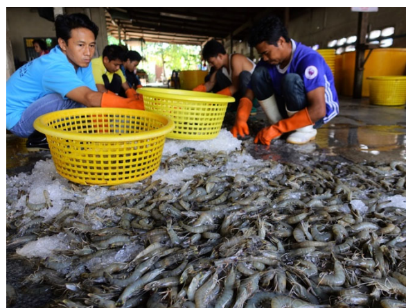
Fig. 2. Sorting operation at a shrimp broker company for giant tiger prawn produced from this study