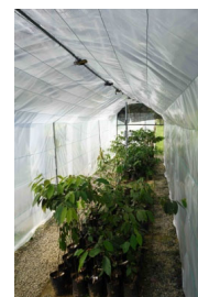
Fig. 1. Leaf production observation system using time-lapse digital cameras