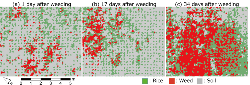
Fig. 2. Spatial distribution map of rice, weed, and soil classified by object-based image analysis of drone images

Extracted statistics from the segments created by the SLIC (Simple Linear Iterative Clustering) method are used as input values for random forest classifier.