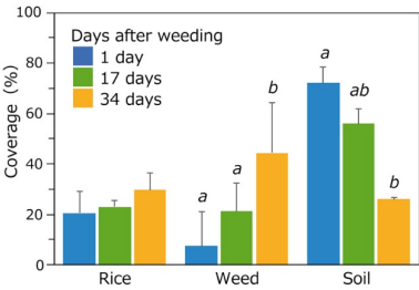
Fig. 3. Comparison of rice, weed, and soil coverages

Different letters on the bar indicate significant differences at 5% level (Tukey HSD).