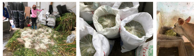
Fig. 1. Preparation (left), storage (middle) and dairy cattle feeding (right) on fermented TMR