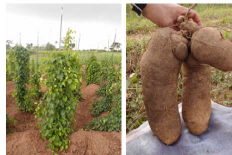
Fig. 1. Cultivation of Guinea yam in West Africa (left) and harvested tubers (right)