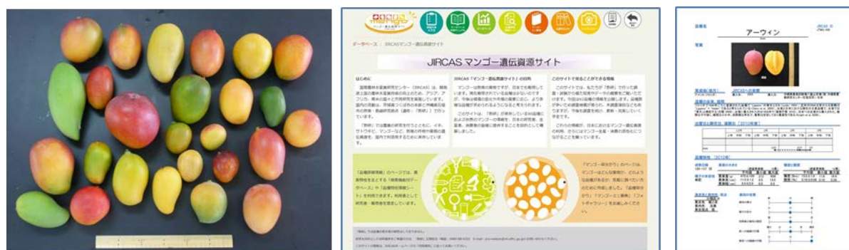
Fig. 2. Mango genetic resources conserved at JIRCAS (left), a screenshot of the top page of the “JIRCAS Mango Genetic Resources Site” (center), and a linked page on the website, showing important information on mango variety characteristics (right).