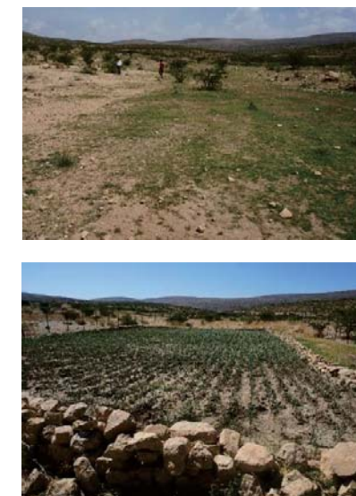
Fig. 3. The reclaimed farmland using sediments from Adizaboy micro-dam Top: before reclamation, Bottom: after reclamation