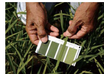
Fig. 1. Measuring the LCC value

P and K (only in Zero and U3.25 treatments) were split-applied as inorganic fertilizers at conventional timings.