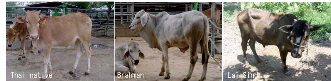
Photo 1. Cattle breeds used in measuring methane emissions