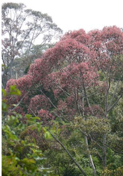
Fig. 1. Seeding of S. curtisii (at Semangkok Forest Reserve in July 2014)