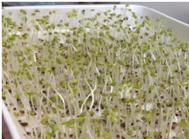
Fig. 1. Broccoli sprouts cultivated with slightly acidic electrolyzed water