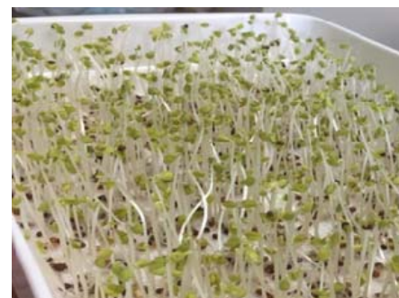
Fig. 1. Broccoli sprouts cultivated with slightly acidic electrolyzed water