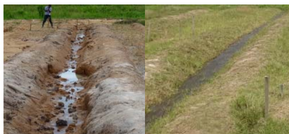
Fig. 3. Test canal 6 months after installing Left: Canal without vegetation Right: Canal planted with ground covers