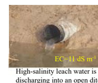
Fig. 2. Outlet of collecting drain