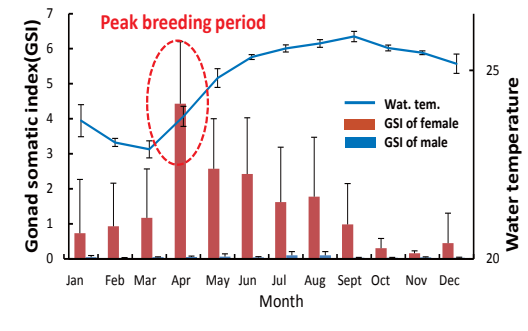
Fig. 3. Seasonal changes in the GSI of Pa koh and in water temperature.