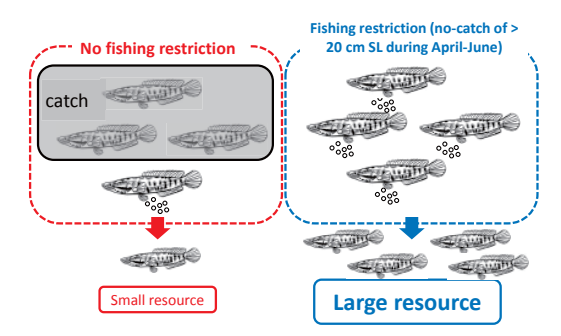
Fig. 4. Images showing the effects of unrestricted and restricted fishing