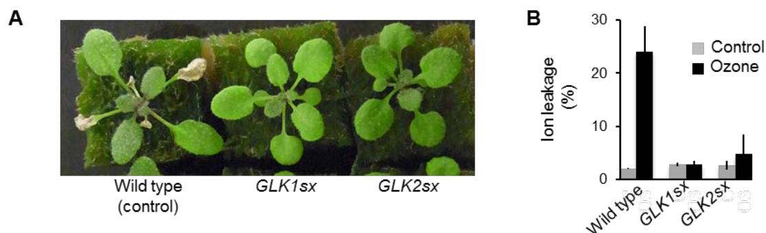
Fig. 1. Sensitivity to ozone of GLK1/2-downregulated Arabidopsis .