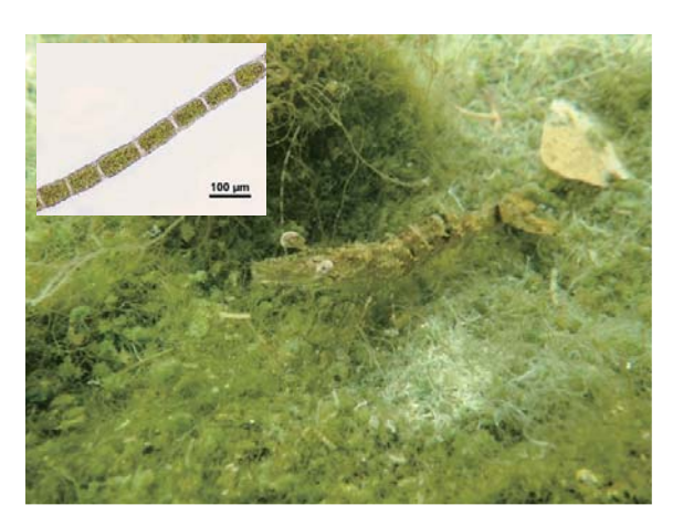
Fig. 1. Chaetomorpha sp. and giant tiger prawn. Inset photo (upper left corner) shows microscopic photograph of Chaetomorpha sp.