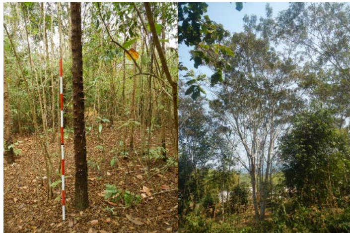
Fig. 2. Villagers prefer these tree species for firewood use (Left: Cratoxylum sp. , Right: P. dasyrachis )