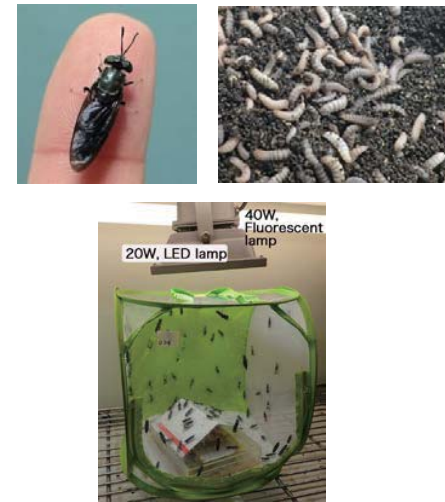
Fig. 1. A female BSF (upper left), larvae (upper right) and adult BSF in a rearing and egg collection cage made of polyethylene (lower photo)