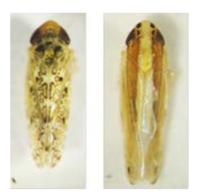
Fig. 1. The vector insects of sugarcane white leaf disease. Left: Matsumuratettix hiroglyphicus (body length: 4mm) Right: Yamatotettix flavovittatus (body length: 5-6mm)