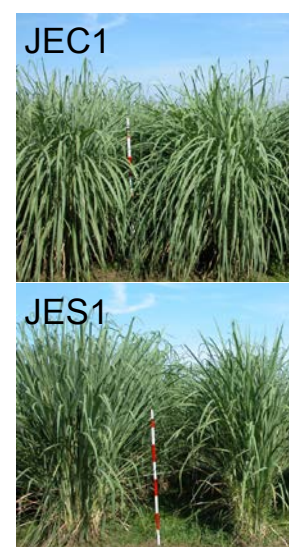
Fig. 1. JEC1 vs JES1

4) Calculated from the number of germinated florets over the total number of florets (Total floret number of JEC1, JES1, KO2-erect was 1451, 1352, and 1264, respectively.)