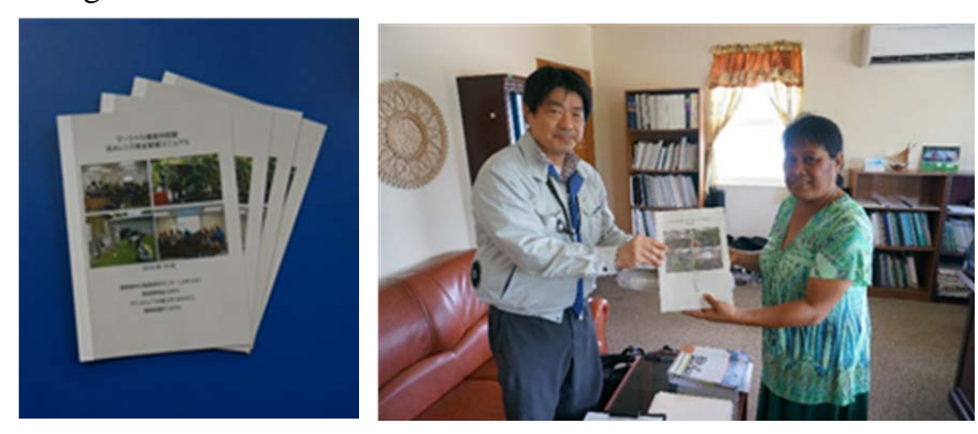
Fig. 2. Laura Lens Conservation and Management Manual