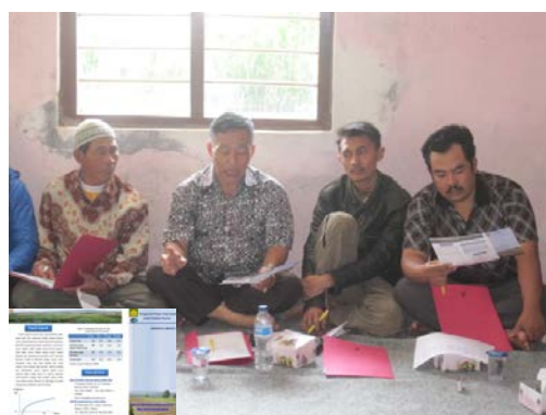
Fig. 3. Field seminar participants reading the information leaflet (inset) written in the local language

URL: http://www.jircas.affrc.go.jp/english/manual/horse_manure/horse_manure.pdf