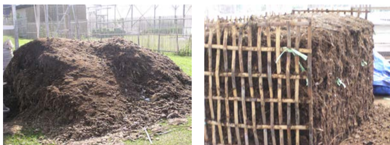
Fig. 1. Horse manure production

Horse dung is piled (left) and fermented in a bamboo cage (right).