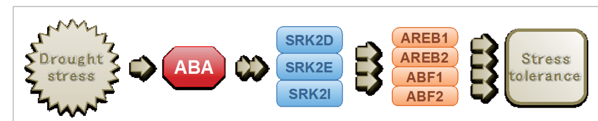
Fig. 2. Model showing the AREB/ABF-SnRK2 pathway that controls ABA-mediated transcriptional regulation in responses to drought stress in plants

the plants were re-watered for 1 week before the photograph was taken. Circles and crosses indicate survival and dead plants, respectively. Wild-type (WT) and two kinds of mutant plants (n = 5 each) were grown in soil in a 9 cm pot. Survival rates were shown in the central column and calculated from the results from eight independent experiments (n=40). Representative result is shown. ** P < 0.01 (Student's t -test, based on comparison with WT)