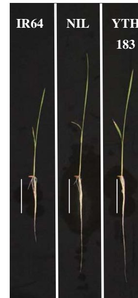
Fig. 1. Typical phenotypes of seedlings grown for 8 days in 5 \mu\text{M} \text{NH}_4\text{Cl} . YTH183 and NIL have positive allele of qRL6.4-YP5 . Scale bar in individual pictures indicates 50 mm.

(M.Obara, T. Ishimaru, T. Abiko [Kyushu University], D. Fujita [Kyushu University], N. Kobayashi [NARO-NICS], S. Yanagihara, Y. Fukuta)