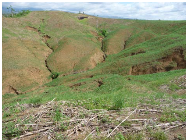
Photo 1. Gully erosion appears at the study site near Ilagan City, Isabela Province, Philippines (taken on November 23, 2010)