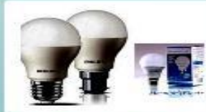
Energy Saving Led Bulbs