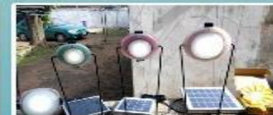
Affordable Solar Lanterns