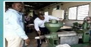
Oil Expellers Coconut oil, Palm kernel & Groundnut