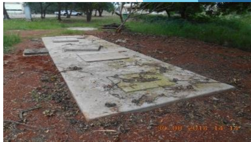
Anaerobic Baffled Reactor (ABR)