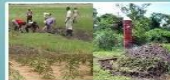
Tree Planting, Afforestation & Improved Charcoal Kilns