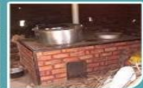
Institutional Cook Stoves

Activities: Training, Consultancy, Research, Community Development & Technology Deployment