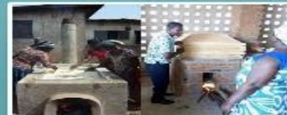
Cook stoves for food processing (Gari roasting & Fish smoking)