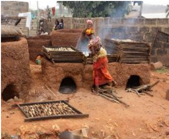
Research & Baseline