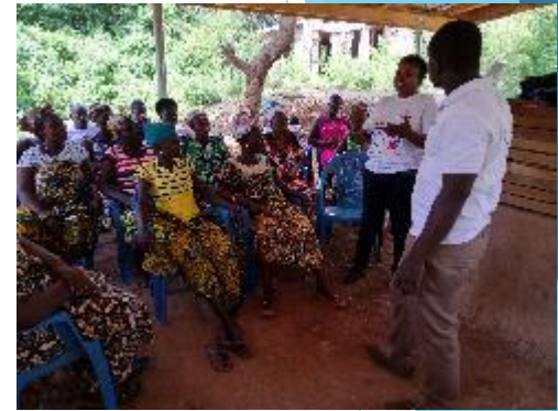
Stakeholder involvement & Knowledge Sharing