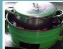
Improved Household Charcoal Cook Stoves