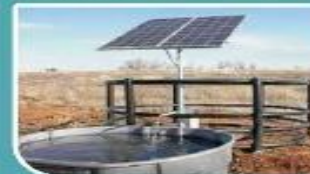
Solar Water Pumping