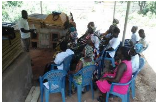
Pilot new concept