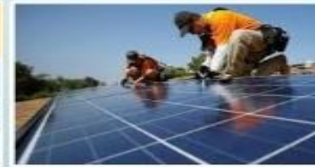
Solar Home System