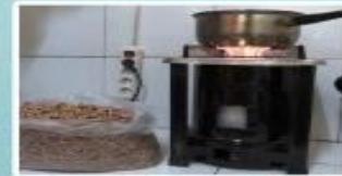
Prime Cook Stoves & Fuels