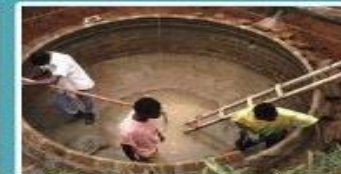
Biogas (waste to energy)