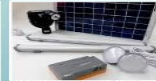
Solar Home Lighting