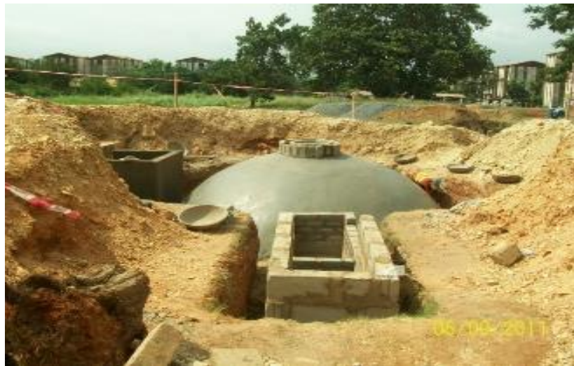
» Fixed Dome