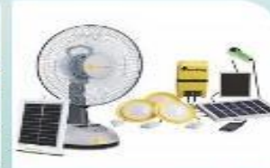
Solar Home Lighting