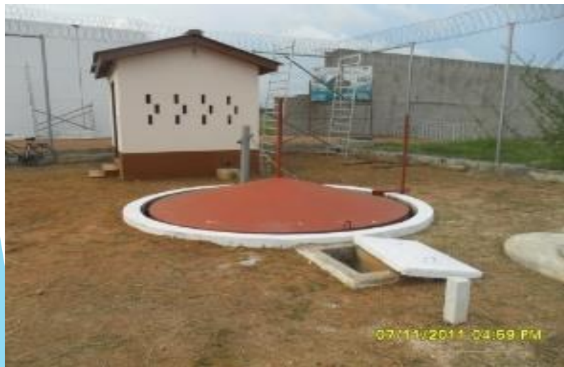
» Floating Drum