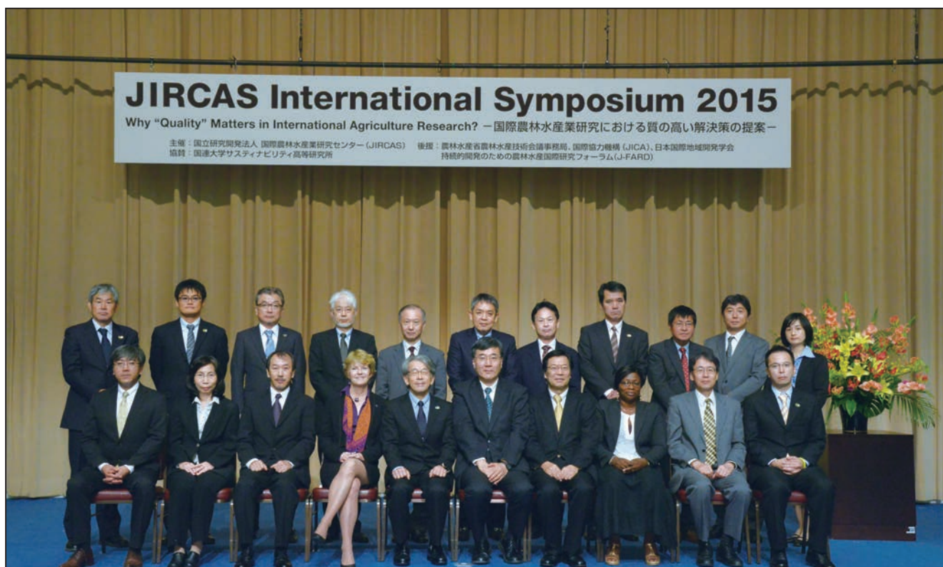
JIRCAS International Symposium 2015 U Thant International Conference Hall, Tokyo, Japan Wednesday, October 28, 2015