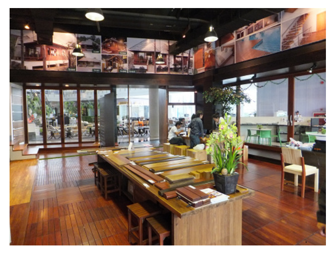
Fig. 2. Tha Sao Sawmill's shop in Bangkok.

One of their unique technical characteristics was the use of an anti-UV treatment coating on their wood products. The technique produced a luster on the wood products and improved durability. Tha Sao Sawmill was the only company to use this technique in Thailand at the time of research in 2012, and therefore produced superior wood products when compared with other teak manufacturers. Furthermore, the company used an important sales strategy whereby they only sell their products to their directly managed shops. The company had a nationwide sales network in Thailand; shops are located in Bangkok (Fig.2), Chiang Mai, Phuket, Chon Buri, and Surat Thani.