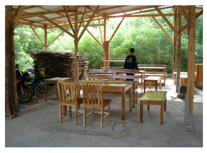
Fig. 3. Furniture factory managed by Lop Buri PFPC

In total, 21 people living in the neighboring area were