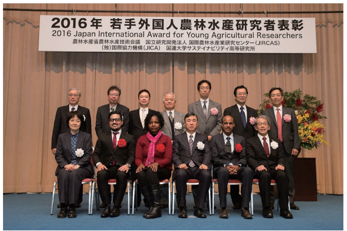
Awardees, members of the selection committee, and other officials

The 2016 awardees and their research achievements are as follows: