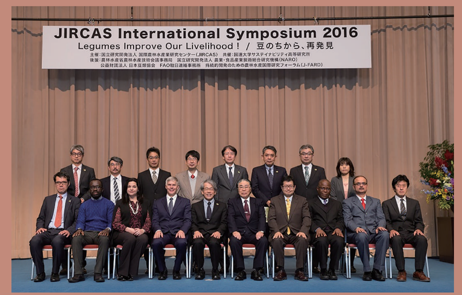
Session chairpersons and symposium speakers