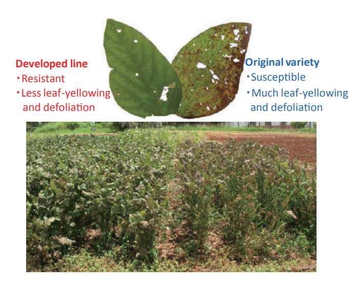
Fig. 2. ASR-resistant line developed by utilizing the genepyramided line in Paraguay (left) and the original variety carrying no resistance gene (right)