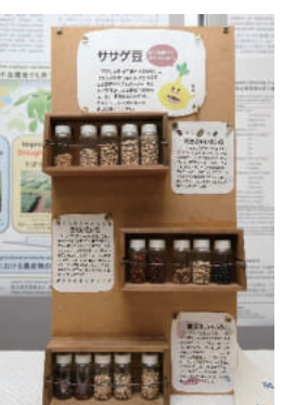
Various bean specimens