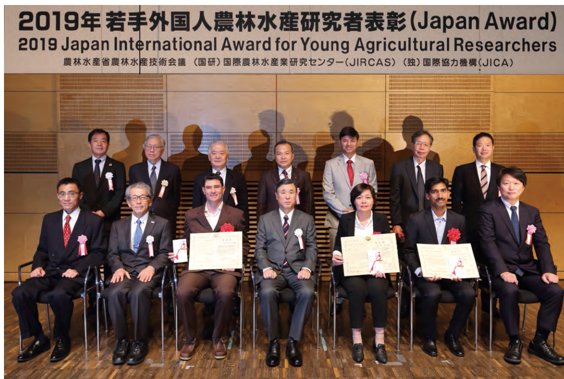
2019 Japan Award commemorative photo