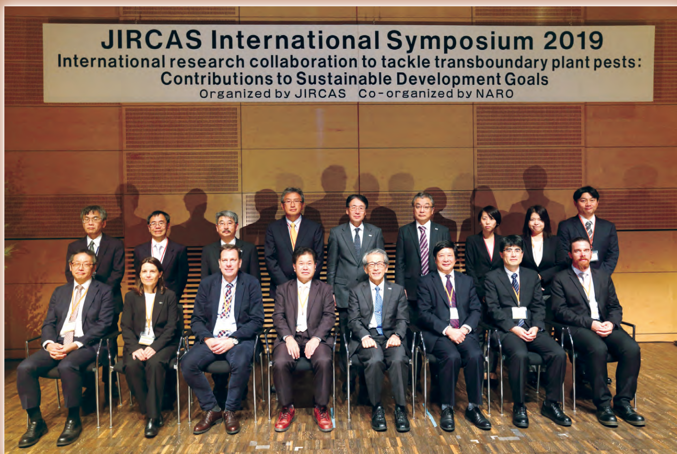
JIRCAS International Symposium 2019 (Tsukuba International Congress Center, November 26, 2019)

Special Feature: JIRCAS International Symposium 2019