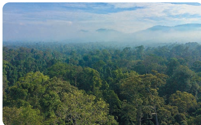
Photo 2. Pasoh Forest Reserve