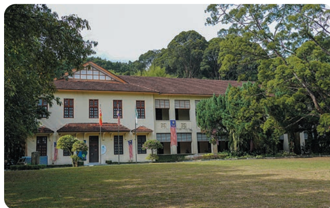
Photo 1. FRIM Main Building