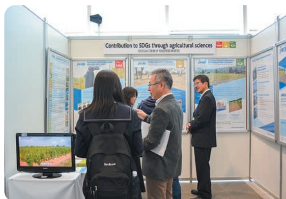
JIRCAS's exhibit booth at G20 Niigata