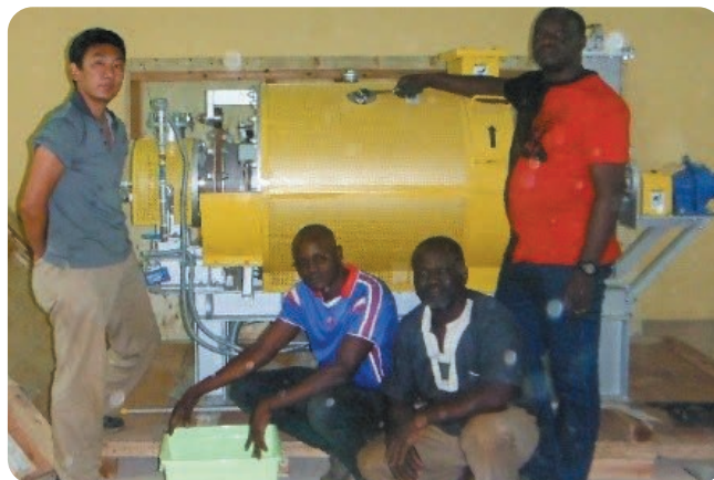
Installation of equipment for PR calcination in Burkina Faso