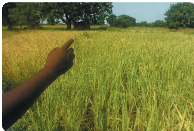
Phosphate rock (PR) direct application experiment at a rainfed lowland rice field in Burkina Faso