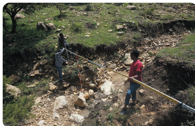
Photo 1. Gully erosion at the upstream part of Adizaboy micro-watershed

Crop, Livestock and Environment Division