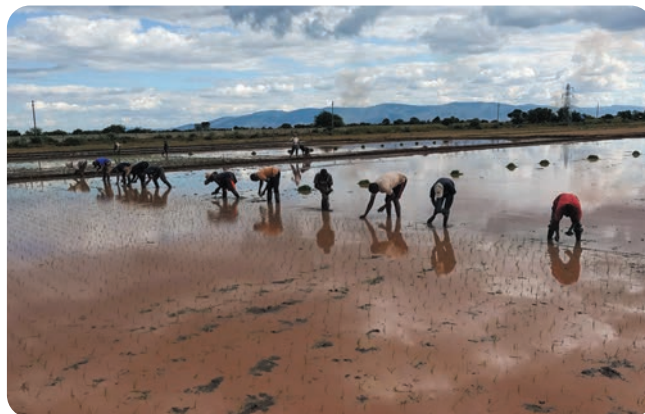
Transplanting seedlings for experiments in a farmer's field (Tanzania)

Biological Resources and Post-harvest Division