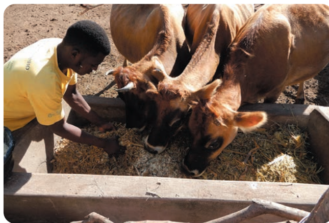
Photo 1. Feeding silage and wheat bran to dairy cattle

Crop, Livestock and Environment Division