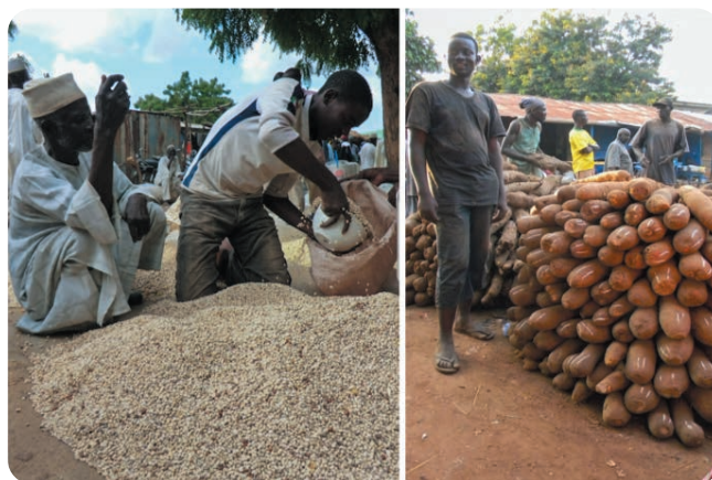
Photo 1. Cowpea (left) and Guinea yam (right) play important roles in the regional food culture of West Africa