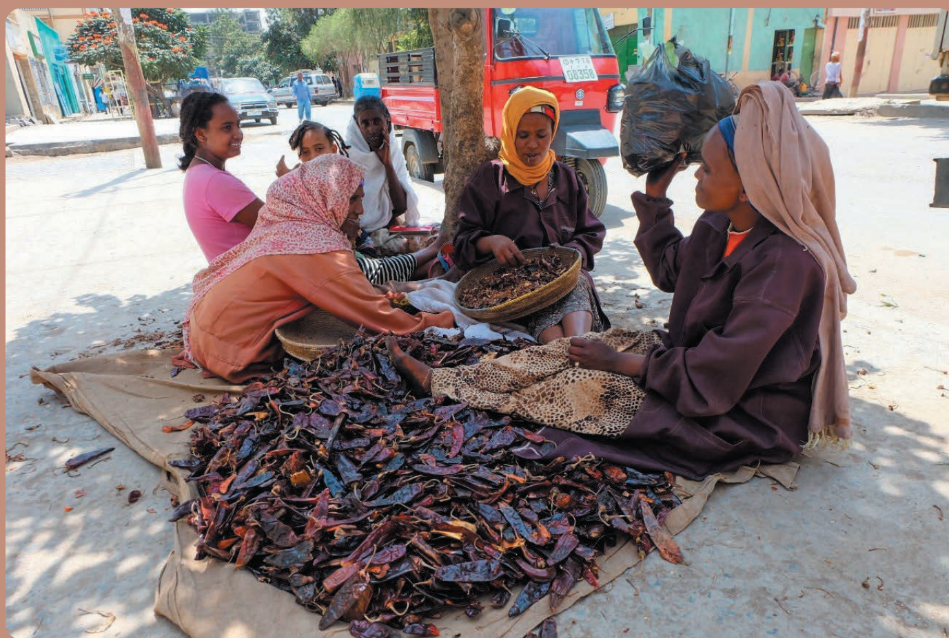
Women in Mekelle City, Ethiopia, sorting chili peppers, an essential ingredient in Ethiopian cuisine

Special Feature: JIRCAS Initiatives in Africa