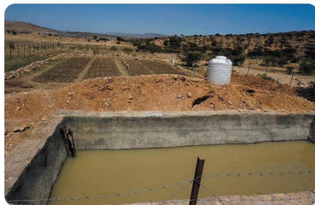
Photo 2. The reclaimed farmland near Adizaboy micro-dam where vegetable cultivation tests were conducted