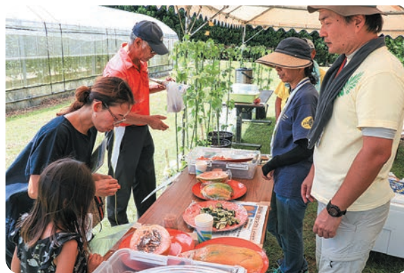
Exhibit and tasting of fruits bred at TARF