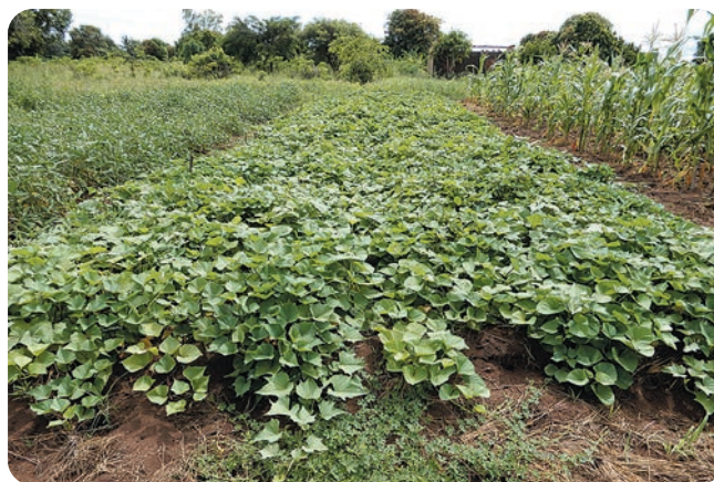
Photo 2. Cowpea, sweet potato, and maize in a farmer's field