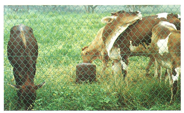
Photo 1: Feeding cattle with molasses blocks as nutrient supplement in Malaysia

The projects listed above are carried out by the researchers of the Division on long-term assignments, often supported with short-term specialists from other sectors. Research projects on a