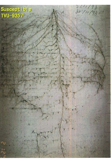
Photo 1: Root distribution patterns of drought-tolerant and susceptible lines of cowpea