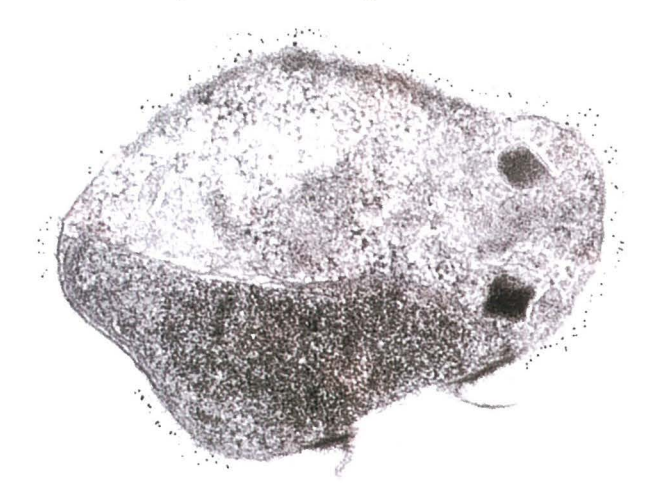
Photo 1: Electron micrograph showing antibody binding to the p67 surface molecule of Theileria parva

The objective of the current cooperative studies is to characterize the inflammatory reaction of the skin of cattle to the bite of the tick, which feeds on cattle blood and infects the animal with T. parva parasites. Since early interactions between the parasite and the bovine immune system have considerable bearing on the success of a vaccine based on "neutralizing" sporozoite parasite form, a clear understanding of the environment into which sporozoites are delivered is important for the development of optimal vaccination strategies. A technology to detect parasite and bovine cytokine messenger RNA in the skin using nonradioactive in situ hybridization will be developed by the JIRCAS researcher currently engaged in collaborative studies at ILRI. This undertaking should both promote basic knowledge on the immunology of ECF and accelerate ILRI's development of a novel genetically engineered vaccine against ECF.