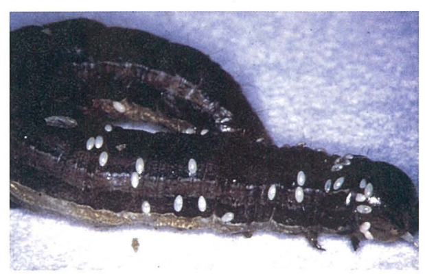
Photo 2: Supernumerary eggs oviposited by E. japonica on M. separata