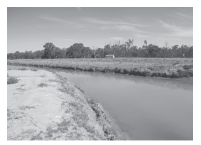
Fig. 3. Earthen canal operated by Murray Irrigation Limited

About 90% of the 2,500 km of irrigation channels is earthen canal, and about 10% is concrete canal. The earthen canals are considered to have an unlimited lifespan with removal of sedimentation soil. The company's engineers consider that the earthen canal would not be destroyed with heavy rains as the precipitation is very limited in the region. However, minimum inspection and rehabilitation would be required as a part of asset management. Concrete canals (Fig. 4) have severely deteriorated as more than 60 years have passed since their construction. Murranbidgee Irrigation