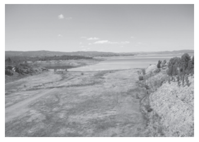
Fig. 2. Burrendong Dam operated by State Water Photographed by the author in March 2008.

State Water has several responsibilities in asset management. State Water must ensure that its assets are managed in a manner consistent with the lowest life cycle cost and acceptable risk of the assets, the whole life of the asset, and its assessment of the risk of loss of the asset and capacity to respond to a potential failure or reduced performance of the assets. State Water also must report to the Independent Pricing and Regulatory Tribunal (IPART) on the state of each group of assets managed by State Water, including a description of the processes, practices, systems, and plans State Water uses in managing the assets, a description of each group of assets, an assessment of the major issues or constraints on current and future performance of the assets, and the strategies and expected costs of future investments in the assets. IPART is the independent economic regulator for NSW, and oversees regulation in the electricity, gas, water, and transport industries and undertakes other tasks referred to it by the NSW Government.