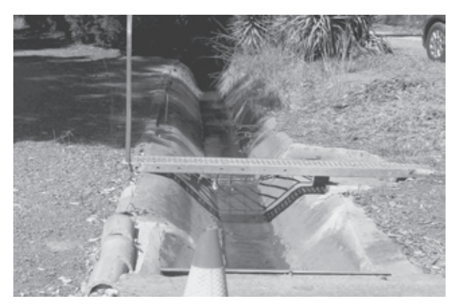
Fig. 4. Concrete canal operated by Murraumbidgee Irrigation Limited Photographed by the author in March 2008.