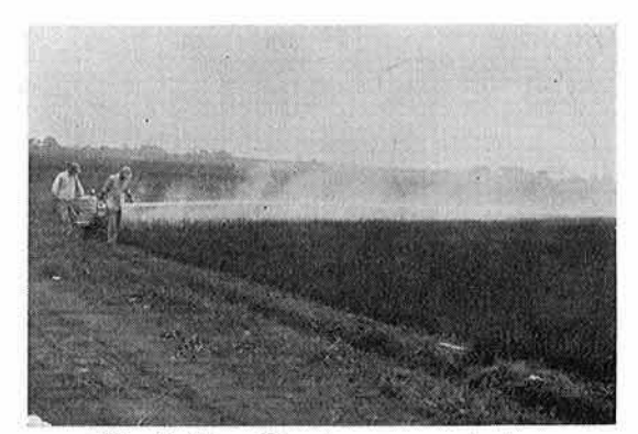
Fig. 2 Travelling type power duster

of types used for lowland rice fields in Japan.