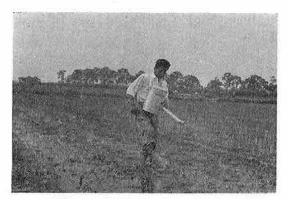
Fig. 4 Hand granule applicator

The tractor mounted type granule applicator has been developed from broad caster which applies much fertilizer such as lime and granular fertilizer at a time, by