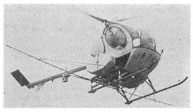
Fig. 5 Liquid application Kit of Helicopter

Aerial application of chemical in America is mostly carried out by airplane while that in Japan mostly by helicoptor. In Japan it is because that no airport for airplane's landing and take off is available near farm and that farm area for which aerial application is performed is too small. But a helicoptor can land or take off at will on a farm road and if it flies at an altitude of less than 25 feet, chemical can be blown in to the roots of crop plants by down oscillation generated by rotation of the rotor. On the other hand, however, as the helicoptor has a chemical carrying capacity much smaller than that of