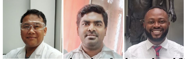
Awardees for Japan Award 2023