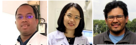
Awardees for Japan Award 2022