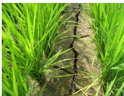
Fig. 1. Paddy field under midseason drainage

Note: As the amount of cadmium absorbed by rice plants may increase in areas with high concentrations of cadmium in the paddy soil, this method is not recommended for such areas. For arsenic in the paddy soil, prolonging mid-season drainage is expected to decrease the absorption of arsenic by rice.