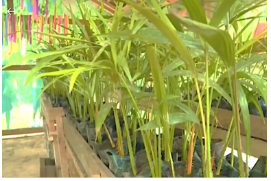
Fig. 5. Sago Nursery of FAO TCP

https://icrea95.wixsite.com/labo/sago-palm-studies