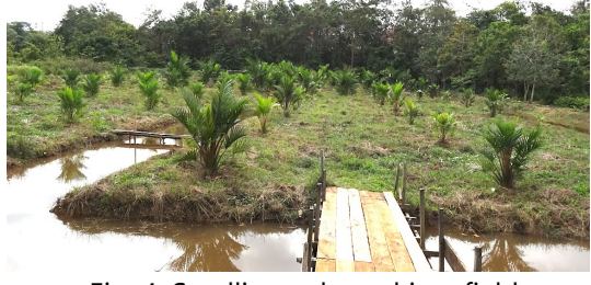
Fig. 4. Seedlings planted in a field (Southeast Sulawesi, Indonesia) Technical details:

https://icrea95.wixsite.com/labo/sago-palm-studies