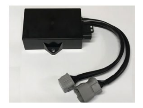
Fig. 3. Commercially available generalpurpose electronic control unit (ECU)