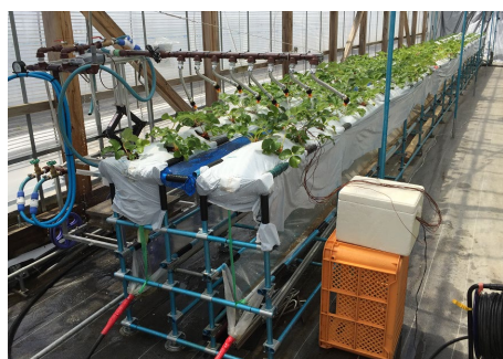
Fig. 1. Hot water spraying device (Rikuzentakata City, Iwate Prefecture)

† Everbearing varieties: fruiting not only in winter and spring, but also in summer and fall.