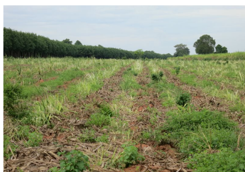
Fig. 1. A field abandoned due to widespread sugarcane white leaf disease (SCWLD)

SCWLD is one of the most devastating insect-borne diseases affecting sugarcane production in Asia. We considered that the use of healthy seedcane is highly effective in controlling SCWLD. Hence, a manual for the propagation and distribution of healthy seedcane was developed for sugar mills and institutions that produce and distribute seedcane to farmers (Fig. 2). Verification test demonstrated sufficiently low rate of healthy seedcane even though the number of diseased plants increased up to 10-fold in the third generation (Fig. 3). The insecticides that can be used to control the vector are based on information available in Thailand. Users are advised to check and confirm current pesticide treatment regulations in their respective countries.