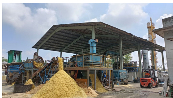
Fig. 3. Demonstration pilot plant in Kluang, Johor, Malaysia