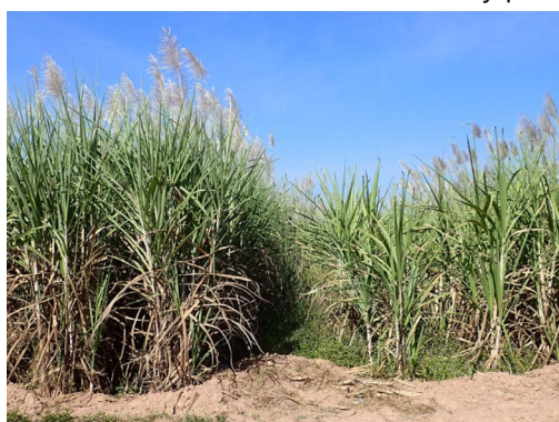
Fig. 1. The growth at second ratooning in Kosum Phisai of Northeast Thailand (December 2014)

* Bagasse is the fibrous material that remains after crushing sugarcane stalks to extract the juice. This material is used as a raw material for electricity production.