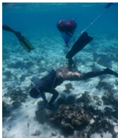
Fig. 2 Deploying wild seedling collectors by snorkeling