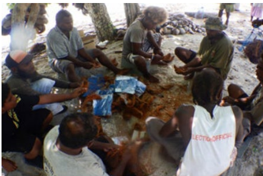
Fig. 1 Removing coconut fiber from the husk

Wild seedling collection is a method of naturally attaching juveniles of invertebrates to materials moored in the sea. Examples of wild seedling collection have been reported for two Apostichopus species of temperate sea cucumbers, but not for tropical sea cucumbers. A tank experiment using hatchery-produced juveniles of the tropical sea cucumber, Stichopus horrens , showed that seedling collection efficiency of coconut fiber and mesh fabric was higher than that of oyster shells. Subsequently, simple seedling collectors filled with coconut fiber (Fig. 1) were moored in the sea for three months (Fig. 2), and multiple species of juvenile sea cucumbers were collected (Fig. 3). The collectors can be made cheaply using husks of commonly consumed coconuts and can be easily installed. Thus, we anticipate widespread adoption among the local fishing community to replenish the sea cucumber resources.