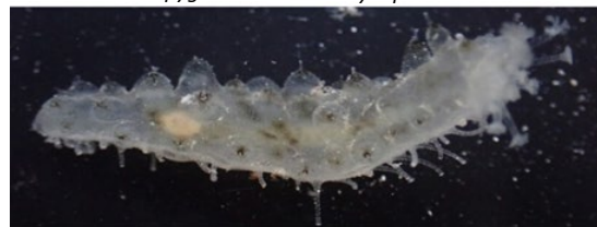
Dragonfish Stichopus cf. horrens