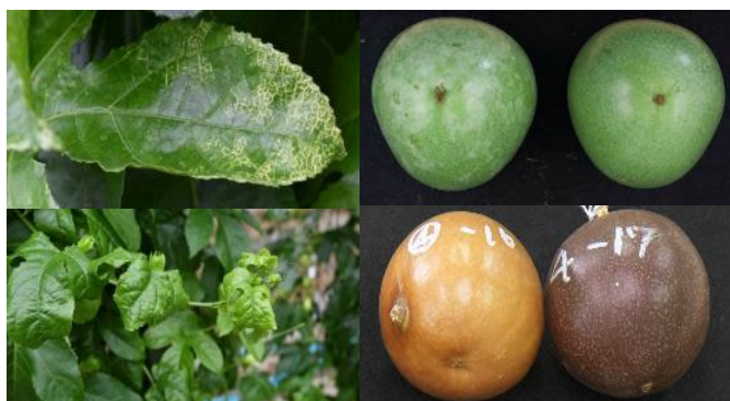
Fig. 1. Viral infection-like symptoms observed in the leaves and fruits of passion fruit

In Asia, passion fruit ( Passiflora edulis ) is produced mainly in Indonesia, India, and Vietnam. Recently, passion fruit production is gaining attention as an alternative crop to tackle climate change in Japan. However, the occurrence of Passiflora latent virus (PLV) diseases is a major problem concern (Fig. 1). Virus infection can spread easily due to vegetative propagation via cuttings. Thus, securing virus-free plants is difficult due to infection of the mother stock used for propagation. We established a method for virus-free propagation of passion fruit from PLV-infected plants using a simple shoot-tip grafting method that can be easily introduced into the field without any aseptic technique and facility (Fig. 2). This method may be effective against other viruses and viral infection related symptoms of unknown cause in the production countries for the propagation of healthy seedlings.