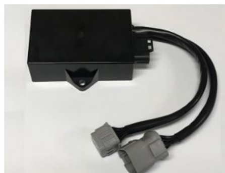
Fig. 3. Commercially available general-purpose electronic control unit (ECU)