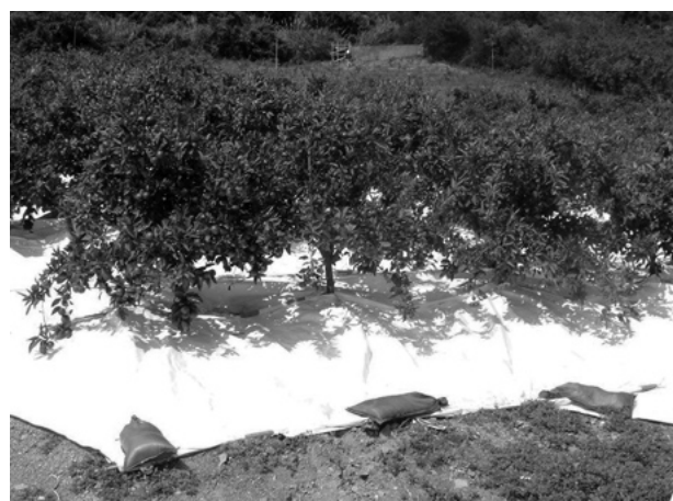
Fig. 2. Plastic sheeting for sheet mulching in a citrus orchard