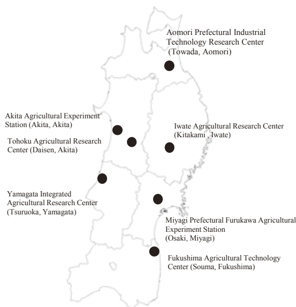
Fig. 2. Location of seven breeding stations in the Tohoku region where cold tolerance experiments were practiced

The cold tolerance of these varieties was evaluated within each heading stage group using a deep-water irrigation system. Cold water was maintained at a constant temperature between from 18.0 to 19.6°C, and at a constant depth between 17 and 30cm from panicle initiation to the heading stage. The heading date was investigated and the percentage sterility and culm length were measured at the maturing stage.