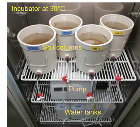
Fig. 1. Apparatus consisting of soil column systems for the three experiments Water is leached at a fixed rate (1.73 cm day -1 ) by the pump.

(K. Minamikawa, T. Makino [Tohoku University, Japan])