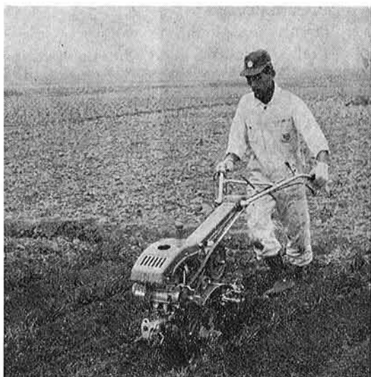
Fig. 2. Inter-cultivating test

so that it would give the maximum performance of 50 passes for ploughing and 15 passes for tilling on the straight 50 meters marked off with white lines. Headland ploughing and tilling shall be omitted. Under the work, depth of working, width, travelling speed, turning time are measured and after the work, fuel consumption, exposure of stumps etc. are measured or observed. The evaluation of the performance is made on the basis of all those data. The performance level at present is shown in Table 1.