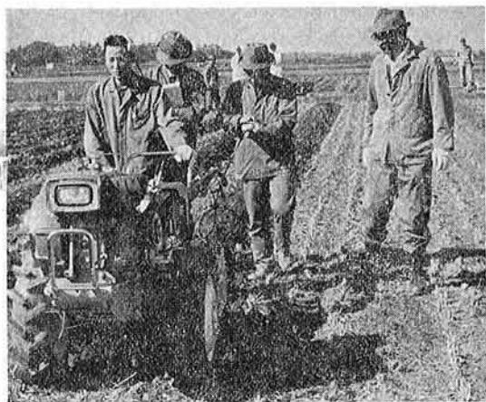
Fig. 4. Handling test (measurement of noise)

The object of this test is intended to ascertain the ease of handling of the tractor and its implements. The tractor with the same implements as in the case of the field performance test is handled by inspectors to see whether it has such defects as they will be causes of the danger and fatigue of workers or not.