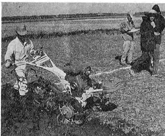
Fig. 1. Ploughing test